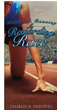
Rules for Running a Rewarding Race by Charles R. Swindoll booklet

For these and related resources, visit insightworld.org/store or call USA 1-800-772-8888 • AUSTRALIA +61 3 9762 6613 • CANADA 1-800-663-7639 • UK +44 1306 640156