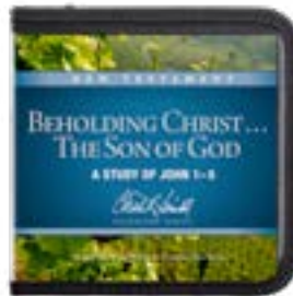
Beholding Christ . . . The Son of God: A Study of John 1–5 by Charles R. Swindoll CD series