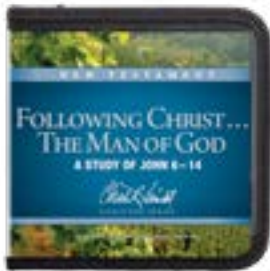
Following Christ . . . The Man of God: A Study of John 6–14 by Charles R. Swindoll CD series