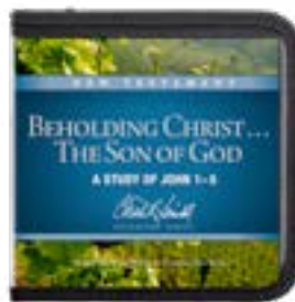
Beholding Christ . . . The Son of God: A Study of John 1–5 by Charles R. Swindoll CD series