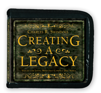
Creating a Legacy by Charles R. Swindoll CD series