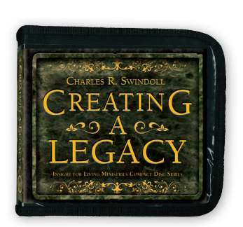
Creating a Legacy by Charles R. Swindoll CD series