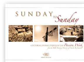
Sunday to Sunday: A Pictorial Journey Through the Passion Week by Charles R. Swindoll and Insight for Living softcover book