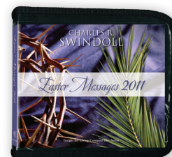
Easter Messages 2011 by Charles R. Swindoll CD series