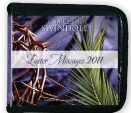
Easter Messages 2011 by Charles R. Swindoll CD series