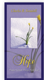
Hope: Expect Great Things from God by Charles R. Swindoll booklet

For related resources, please call USA 1-800-772-8888 AUSTRALIA 1300 467 444 CANADA 1-800-663-7639 UK 0800 787 9364 or visit www.insight.org or www.insightworld.org