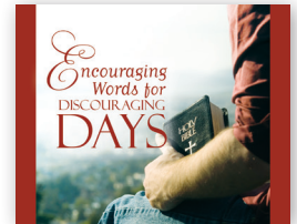
Encouraging Words for Discouraging Days by Charles R. Swindoll CD series