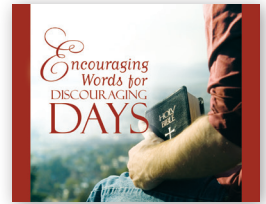
Encouraging Words for Discouraging Days by Charles R. Swindoll CD series