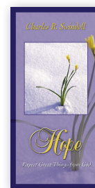
Hope: Expect Great Things from God by Charles R. Swindoll booklet

For related resources, please call USA 1-800-772-8888 AUSTRALIA 1300 467 444 CANADA 1-800-663-7639 UK 0800 787 9364 or visit www.insight.org or www.insightworld.org