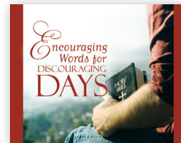
Encouraging Words for Discouraging Days by Charles R. Swindoll CD series