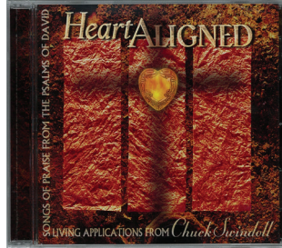
Heart Aligned: Songs of Praise from the Psalms of David with Living Applications from Chuck Swindoll music CD