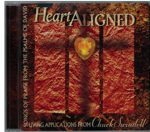
Heart Aligned: Songs of Praise from the Psalms of David with Living Applications from Chuck Swindoll music CD