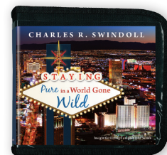
Staying Pure in a World Gone Wild by Charles R. Swindoll CD series