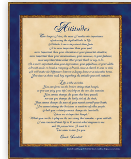
Attitudes Quote Color Print by Charles R. Swindoll color print

For related resources, please call USA 1-800-772-8888 • AUSTRALIA 1300 467 444 • CANADA 1-800-663-7639 • UK 0800 787 9364