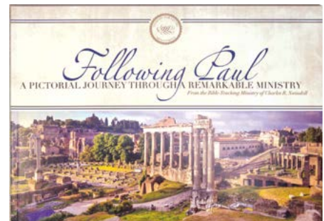
Following Paul: A Pictorial Journey Through a Remarkable Ministry by Insight for Living Ministries softcover book

For these and related resources, visit store.ifl.org.au or call AUSTRALIA 1300-467-444 • USA +61 1-800-772-8888 • CANADA 1-800-663-7639 • UK +44 1306 640156