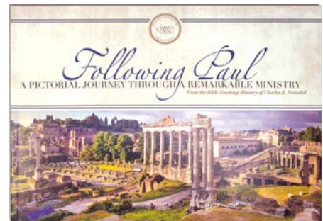
Following Paul: A Pictorial Journey Through a Remarkable Ministry by Insight for Living Ministries softcover book

For these and related resources, visit www.insightworld.org/store or call USA 1-800-772-8888 • AUSTRALIA +61 3 9762 6613 • CANADA 1-800-663-7639 • UK +44 1306 640156