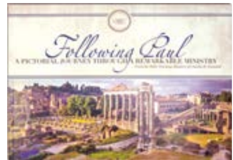
Following Paul: A Pictorial Journey Through a Remarkable Ministry by Insight for Living Ministries softcover book

For these and related resources, visit store.ifl.org.au or call AUSTRALIA 1300-467-444 • USA +61 1-800-772-8888 • CANADA 1-800-663-7639 • UK +44 1306 640156