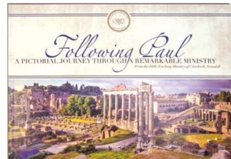
Following Paul: A Pictorial Journey Through a Remarkable Ministry by Insight for Living Ministries softcover book

For these and related resources, visit www.insightworld.org/store or call USA 1-800-772-8888 • AUSTRALIA +61 3 9762 6613 • CANADA 1-800-663-7639 • UK +44 1306 640156