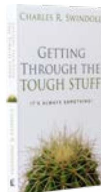
Getting Through the Tough Stuff by Charles R. Swindoll softcover book

For these and related resources, visit www.store.ifl.org.au or call AUSTRALIA 1300 467 444 • USA 1-800-772-8888 • CANADA 1-800-663-7639 • UK +44 1306 640156