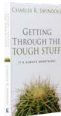
Getting Through the Tough Stuff by Charles R. Swindoll softcover book

For these and related resources, visit www.store.ifl.org.au or call AUSTRALIA 1300 467 444 • USA 1-800-772-8888 • CANADA 1-800-663-7639 • UK +44 1306 640156