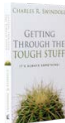
Getting Through the Tough Stuff by Charles R. Swindoll softcover book

For these and related resources, visit www.store.ifl.org.au or call AUSTRALIA 1300 467 444 • USA 1-800-772-8888 • CANADA 1-800-663-7639 • UK +44 1306 640156