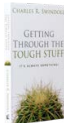
Getting Through the Tough Stuff by Charles R. Swindoll softcover book

For these and related resources, visit www.store.ifl.org.au or call AUSTRALIA 1300 467 444 • USA 1-800-772-8888 • CANADA 1-800-663-7639 • UK +44 1306 640156