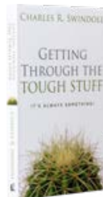
Getting Through the Tough Stuff by Charles R. Swindoll softcover book

For these and related resources, visit www.store.ifl.org.au or call AUSTRALIA 1300 467 444 • USA 1-800-772-8888 • CANADA 1-800-663-7639 • UK +44 1306 640156