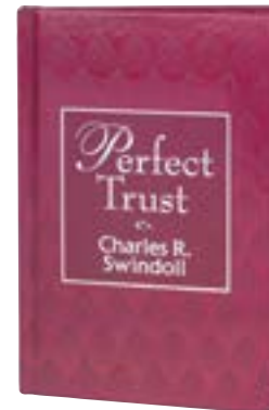
Perfect Trust by Charles R. Swindoll hardback book

For these and related resources, visit www.insightworld.org/store or call USA 1-800-772-8888 • AUSTRALIA +61 3 9762 6613 • CANADA 1-800-663-7639 • UK +44 1306 640156