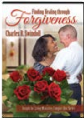
Finding Healing through Forgiveness by Charles R. Swindoll 2-CD set