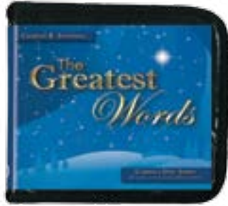
The Greatest Words by Charles R. Swindoll CD series