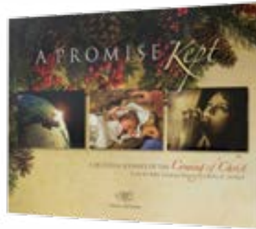
A Promise Kept: A Pictorial Journey of the Coming of Christ by Insight for Living Ministries softcover book