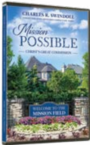
Mission Possible: Christ's Great Commission by Charles R. Swindoll CD series