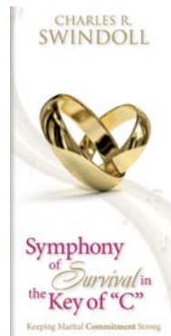
Symphony of Survival in the Key of “C”: Keeping Marital Commitment Strong by Charles R. Swindoll booklet