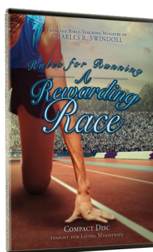
Rules for Running a Rewarding Race by Charles R. Swindoll single CD