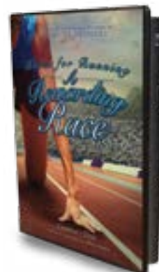
Rules for Running a Rewarding Race by Charles R. Swindoll CD message

For these and related resources, visit www.insightworld.org/store or call USA 1-800-772-8888 • AUSTRALIA +61 3 9762 6613 • CANADA 1-800-663-7639 • UK +44 1306 640156