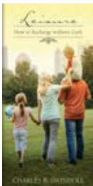
Leisure: How to Recharge without Guilt by Charles R. Swindoll booklet